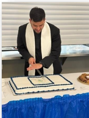
The Congratulations cake